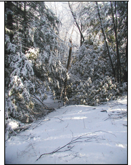
Winter view at Jeans Run.

[Ed. Note: To reach the start of this hike from Jim Thorpe, head toward Nesquehoning on US 209. Turn right onto PA 93. A map of Game Land 141 showing the parking areas and trails is available on the PA Game Lands web site at http://www.pgc.state.pa.us/pgc/lib/pgc/counties/maps/141a.pdf . The USGS topographic map covering this area is the Weatherly quadrangle.]