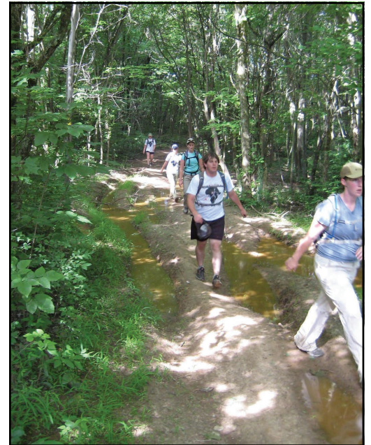
Hikers negotiate a section of the Rachel Carson trail rutted and eroded by ATVs.

[Ed. Note: The author is a former ATV and motorcycle safety instructor.]