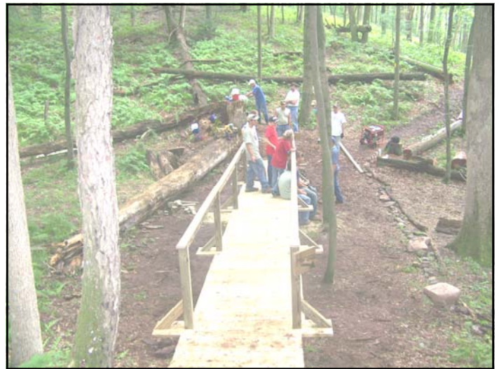
A new footbridge, built by Ian Lloyd and Boy Scout Troop 408, spans a boggy section of the recently re-routed trail in Fort Indiantown Gap Military Reservation. Posted signs direct horses to travel along side the bridge.