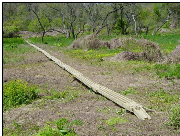
The trail maintainer combats mud.

While March Madness envelops your television set, embark on your own personal voyage of quiet discovery in Penn's Woods during mud season!