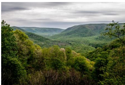
See you April 7-9

If you can't come for the weekend, come for a day! Pre-registration is not required. Cost is $10 per person.