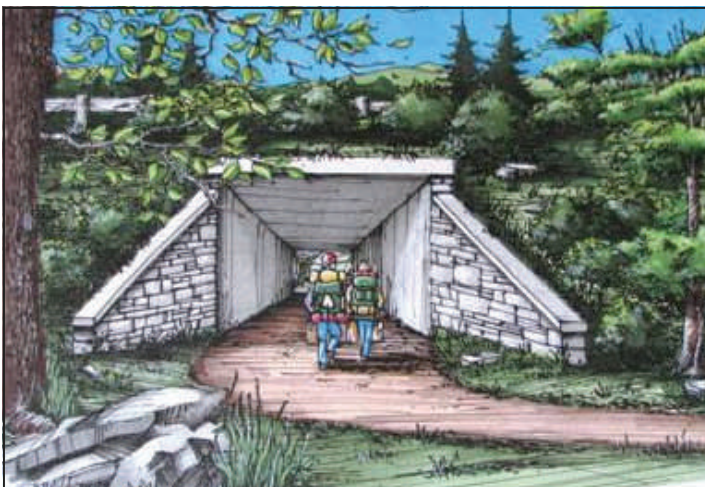
This is the artist’s drawing of the tunnel that will be constructed for hikers under PA944 in Cumberland County. The tunnel will eliminate a dangerous road crossing.

The historic engraved tri-state marker that defines the junction of Pennsylvania, Maryland, and Delaware is expected to soon be in the public domain and the M-DT will either be re-routed to the marker or a spur will be built so that hikers can see this significant