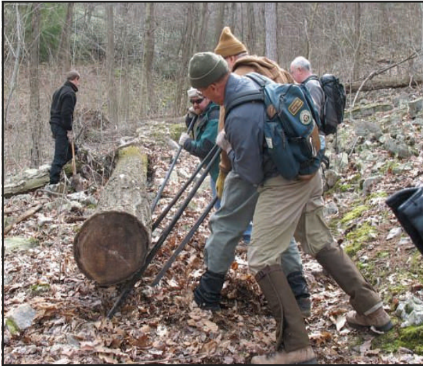
A team of trail maintainers move a log into position. See page 15 for news about KTA Trail Crews.

Non-Profit Org U.S. Postage PAID Confluence, PA Permit #9