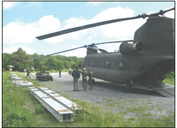
The I-beams and other materials for the Chuck Keiper Bridge are lined up for helicopter transport to the construction site.

Rich Scanlon reports that the KTA Trail Crew completed the last of four hiking bridges on the Chuck Keiper Trail in June. These new bridges replace old “slippery log” crossings that were hazardous to use when streams were swollen after rain. Grant money from the Bureau of Forestry and DCNR funded the cost of the materials.