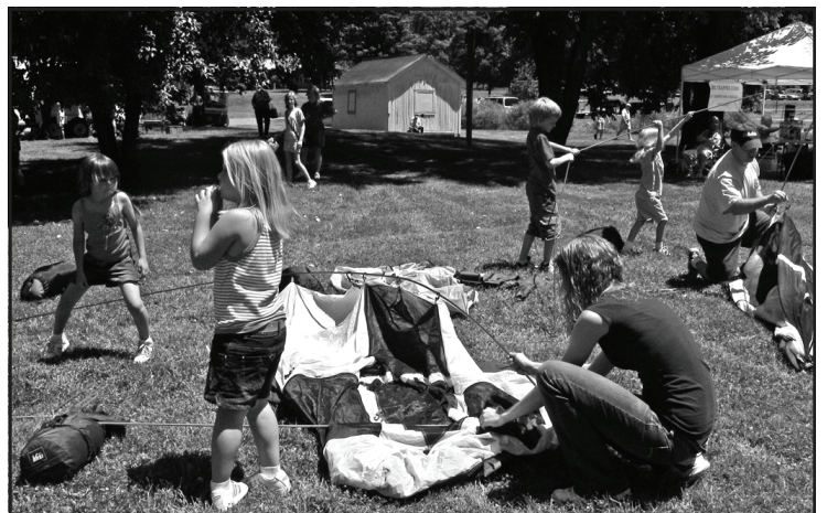
The tent pitching competition at Oil Creek.