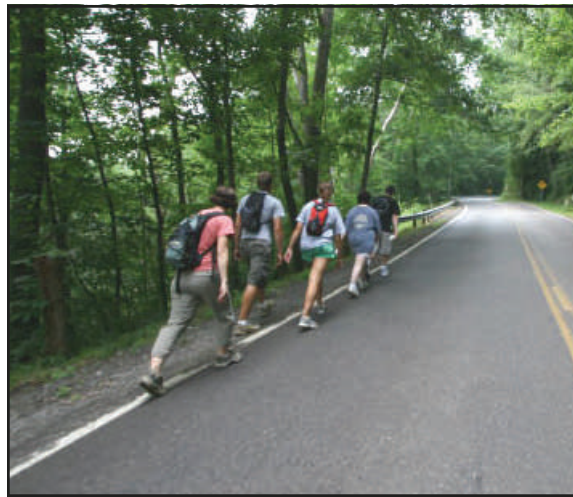
Longitudinal occupancy of a road by hikers, a situation not addressed in the Footpath Crossing Master Agreement.

As far as can be determined now, before any FMG has submitted a Crossing Plan under the Master Agreement, the only substantial difference in the two processes is that, under the Master Agreement, FMGs are responsible for conducting any requested traffic safety studies. As mentioned earlier, we are looking into the possibility of having PennDOT conduct a certain number of safety studies each year. The number of studies conducted each year should be quite low. Hopefully, PennDOT will be willing to make this commitment.