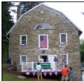
AT Museum at Pine Grove Furnace State Park.

Do you or someone you know have a skill, talent, experience or passion related to the Appalachian Trail to share with the public? Do you have a commitment toward educating the public - young and old - about the AT, its maintaining clubs and our great work? If so, consider signing up as a 2011 program presenter at the Appalachian