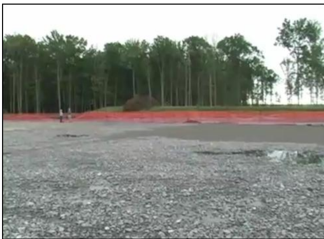
A natural gas drilling pad in the Sproul State Forest. Butch Davey and interviewer stand at the rear of the photo.

"We're only at the very beginning of this gas play. What is it going to be like at the end?"