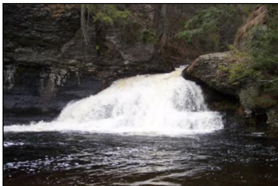
Hackers Falls in the Delaware Water Gap National Recreation Area. The waterfall is located along the new Cliff Park Trail system.

This trail system is unique in that it offers access to two superb waterfalls, Hackers and Raymondskill, several nice views, different forest types and a pond.