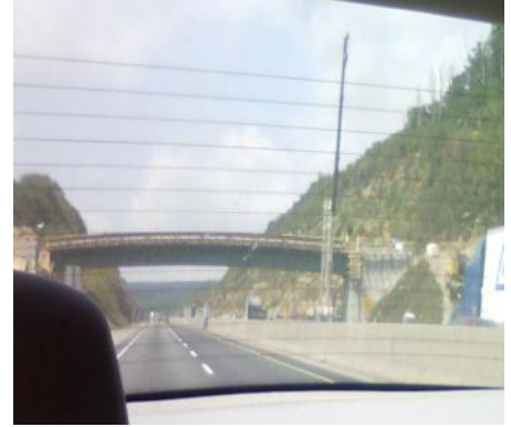
ABOVE: Laurel Highlands Hiking Trail Bridge

Tropical Storm Lee dumped record-setting amounts of rainfall on the Swatara Creek watershed. Wood-