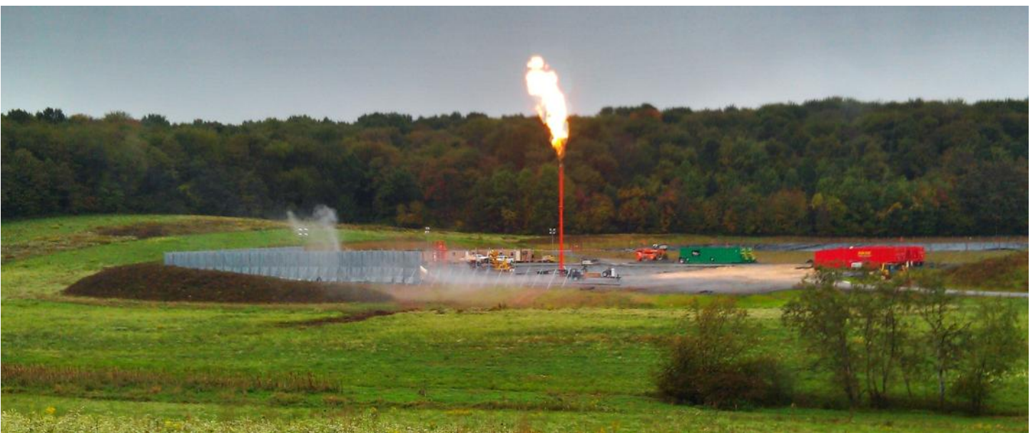
ABOVE: Gas well burn off, as seen by hikers approaching McConnells Mill State Park during the KTA Fall Hiking Weekend, on Cheeseman Road, Portersville, PA 16051.

PA Route 154 and 87 have major road damage and the park is not accessible from these two roads.