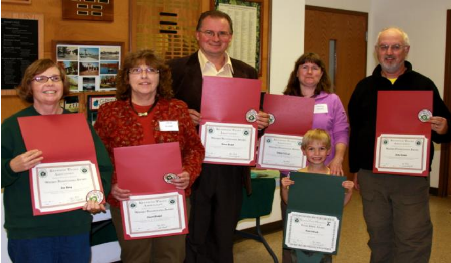
ABOVE: 2011 Hiking Award Recipients at KTA's Annual Meeting on October 1, 2011.