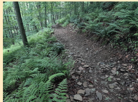
Hammersley sidehill upgrade on the STS, June 2022

The Standing Stone Trail (SST) Club used their grant money to purchase liability insurance for the first time in its history. Liability protection will help ensure that the club remains financially secure in the long term. This risk reduction is particularly relevant given that the Thousand Steps portion of the trail is very popular, with 42,000 hikes counted in 2020. In addition to the funds, KTA put the SSTC in touch with an insurance agent who had worked with KTA and other trail organizations. The agent secured an affordable policy for the SSTC.