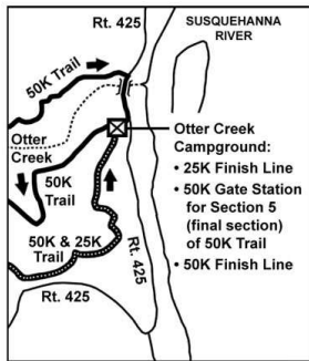
OTTER CREEK CAMPGROUND 25K AND 50K DETAIL