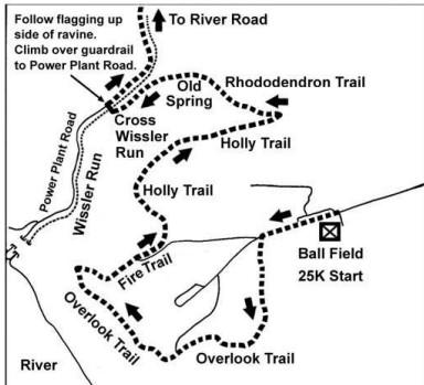
25K START AT SUSQUEHANNOCK STATE PARK

SEE OTHER SIDE FOR STEP-BY-STEP TRAIL DESCRIPTIONS AND MILEAGE