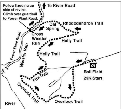
25K START AT SUSQUEHANNOCK STATE PARK

SEE OTHER SIDE FOR STEP-BY-STEP TRAIL DESCRIPTIONS AND MILEAGE